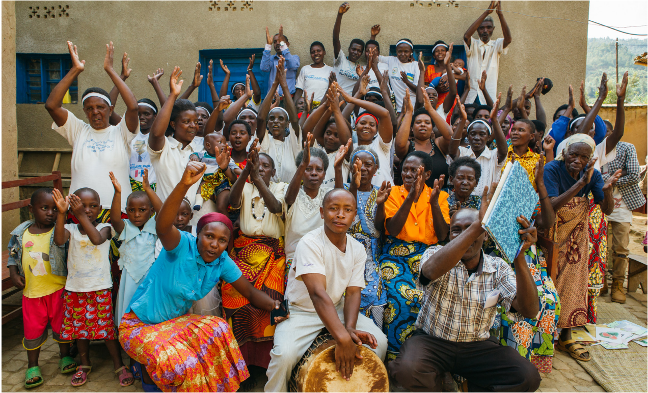
Members of a Community Health Club (CHC) in Rulindo District celebrate after one of their regular sessions.