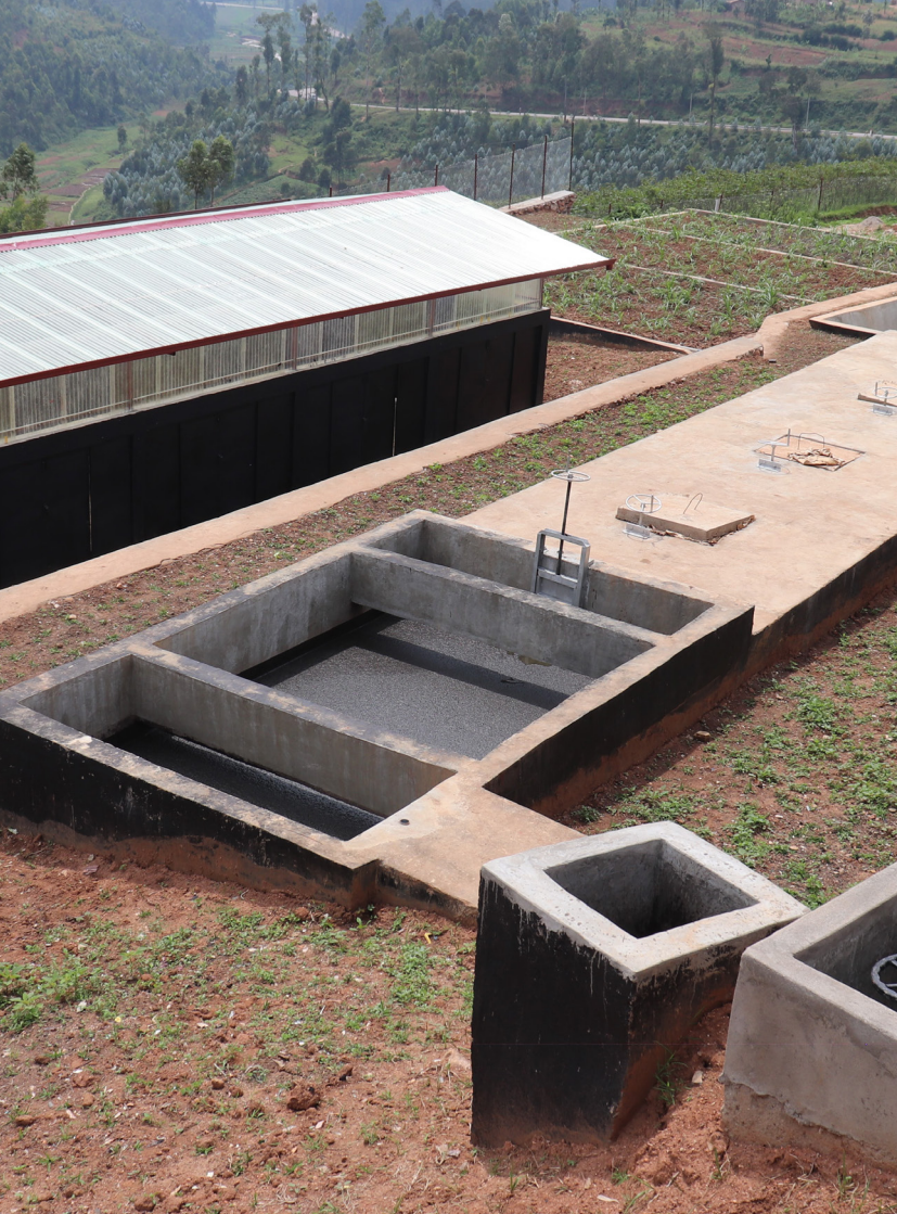
Decentralized Faecal Sludge Treatment plants - like this one in Nyamagabe (Left) - offer opportunities for proper management of sludge. Sludges are transformed into high-quality compost (Right) .