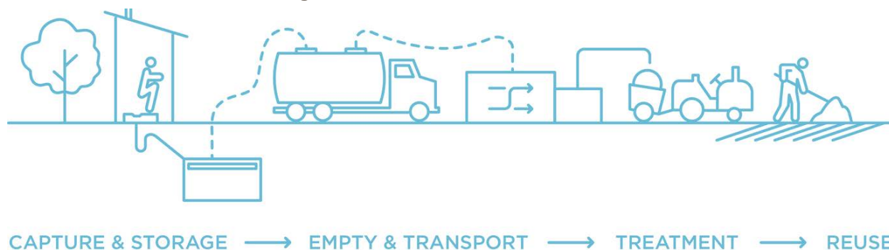
Figure 4: The Sanitation Value Chain

We support government and private sector partners to foster a market of sanitation products and services across the entire sanitation value chain, including: