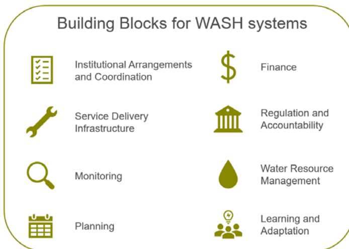
Figure 3: Agenda for Change system-strengthening building blocks

As a founding member of Agenda for Change, Water For People promotes and facilitates each of these building blocks in implementation of the Everyone Forever model. Because we believe they are fundamental to achieving sustainable services across an entire district, Water For People's Theory of Change and each of the key components of our model detailed in the following two sections can be directly mapped to the eight building blocks.