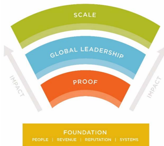
Figure 7: Water For People's Impact Model

At the national level, we also work directly with governments to strengthen the WASH system, focusing on long-term, holistic approaches to support sustainable service delivery and strengthen local institutions and capacity to deliver. Our goal is to ensure that government