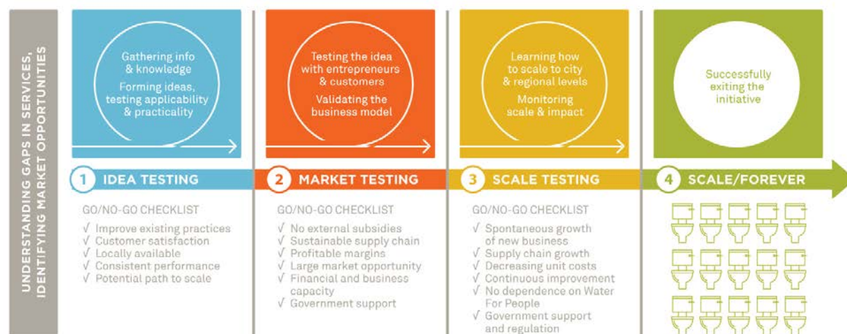
Figure 6: Water For People's Framework for Proving Scalability of Market-Based Initiatives