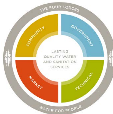
Figure 1: Water For People's Four Forces