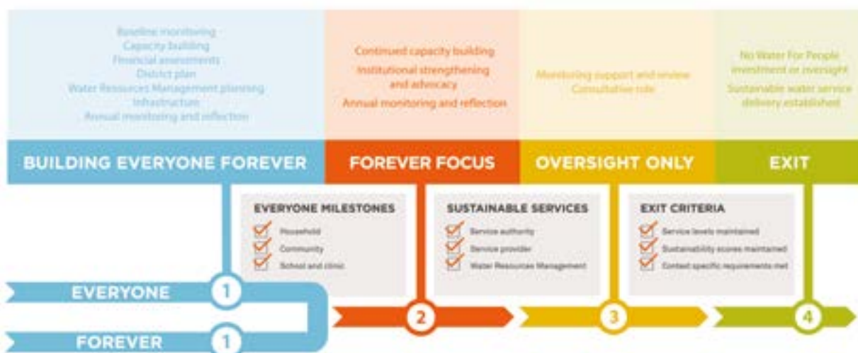
Everyone Forever - A Route to Inclusion and Sustainability

Water For People India promotes key behaviours for the usage of toilets, handwashing practices at critical times, safe storage and water handling practices