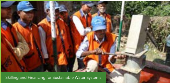
Skilling and Financing for Sustainable Water Systems

The organisation believes in leveraging ground up and top down approach - empowering communities and collaborating with the governments and private sector so that the water systems are protected, managing institutions are functional and funded, sanitation services are available, and communities are self-reliant.