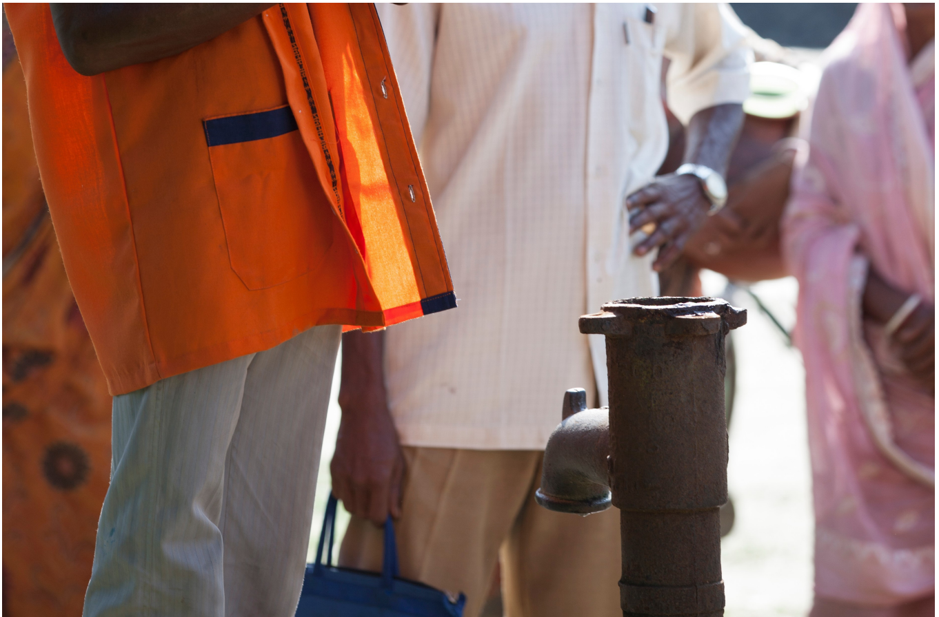
A Jalabandhu (local handpump mechanic) repairs a community water point in India

Water For People helped establish water users committees in communities, and water and sanitation committees in schools, to support the sustainability of these services. The gram panchayat was also instructed in monitoring levels of service, and Jalabandhu (Friends of Water) and Nirmal Bandhu (Friends of Sanitation) were trained to repair and maintain water and sanitation infrastructure. The gram panchayat highlights the key role women played in the transformation through building awareness about safe water and household sanitation practices.